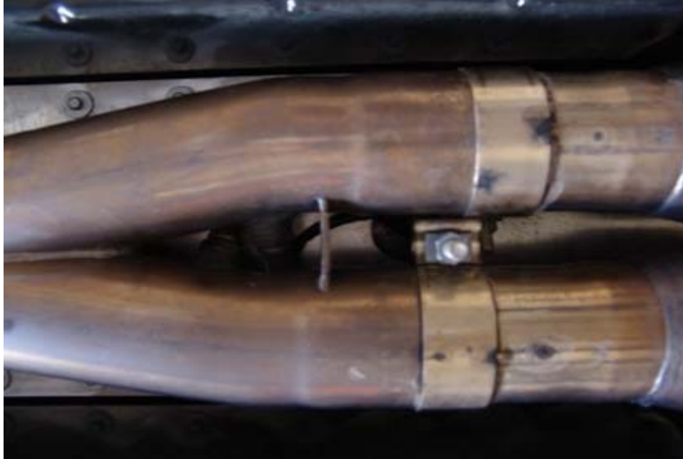
Figure 2: X-pipe location with hole drilled for 02 sensor wires (front is to the right).

At this point the rest of the system can be loosely hung into place. The installed system should look like the picture in Figure 4.