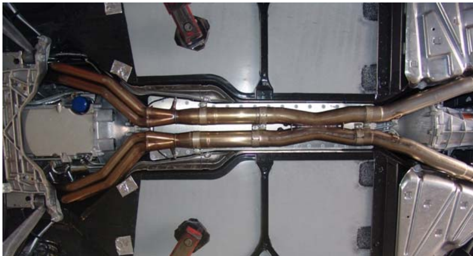
Figure 3: Assembled system (off-road shown).

At this point the rest of the system can be loosely hung into place. The installed system should look like the picture in Figure 4.